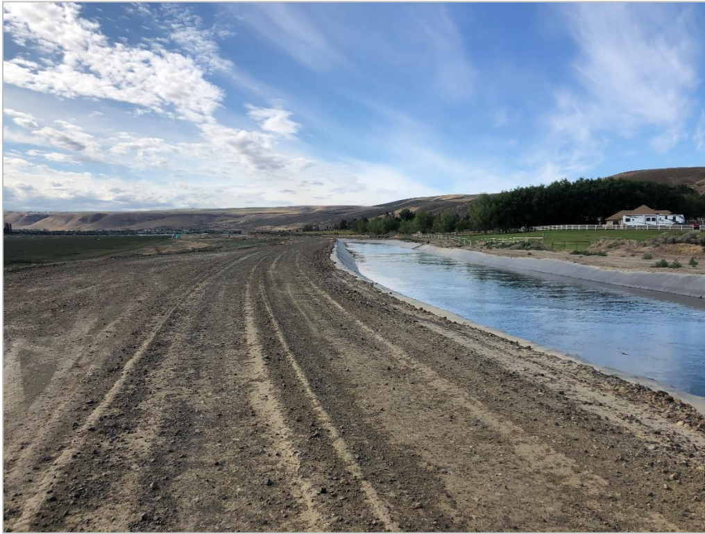
Figure 13. Overview of KID Main Canal Division III east of South Badger Canyon Road, Aspect: East

In total, approximately 59.48 ha (147 ac) of the 71.08 ha (175.65 ac) waterway (83%) were surveyed for CRs. Aside from contemporary items and debris, no other CRs were identified during the survey (Table 24).