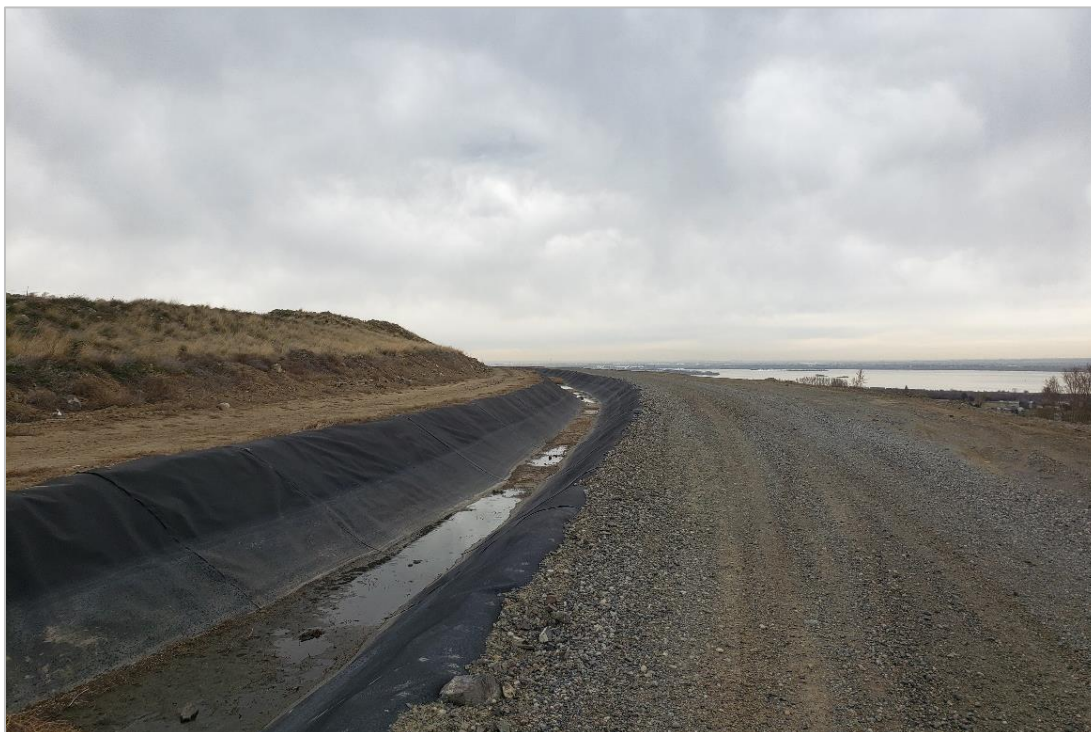
Figure 17. Overview of KID Main Canal Division IV near Meals Road, Finley, Aspect: Northwest