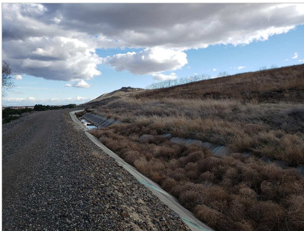
Figure 14. Overview of KID Main Canal Division IV at Turnout 25.8, Aspect: East