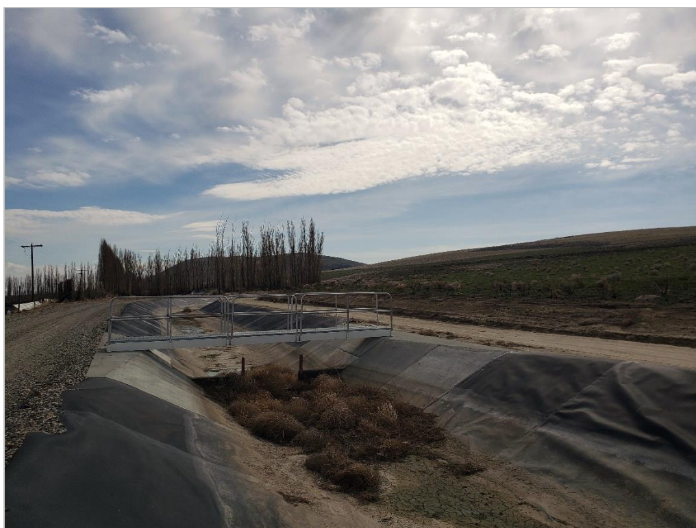
Figure 16. Overview of KID Main Canal Division IV at Turnout 37.6, Aspect: Southeast