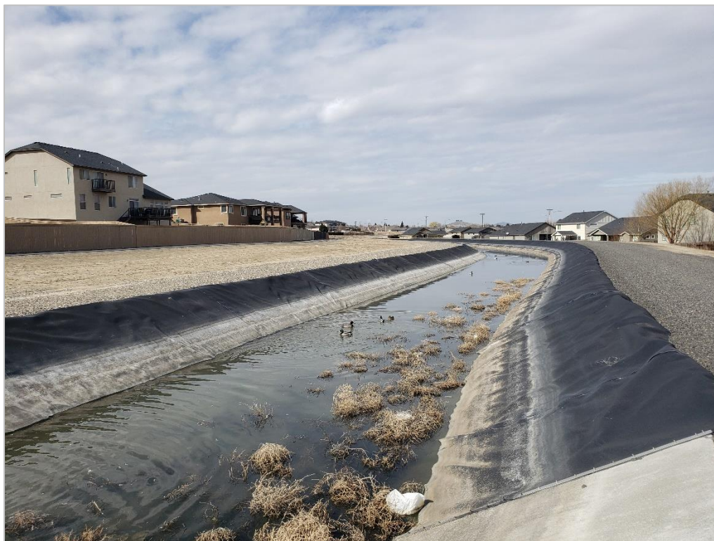
Figure 15. Overview of KID Main Canal Division IV at Turnout 31.5, Aspect: Northwest