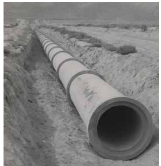
ABOVE: In the 1950s, a pipe carries water from the main canal across Badger Draw to the Badger east and west laterals. The siphon is 3,100 feet long, 48 inches in diameter, and carries water to serve 2,970 acres.