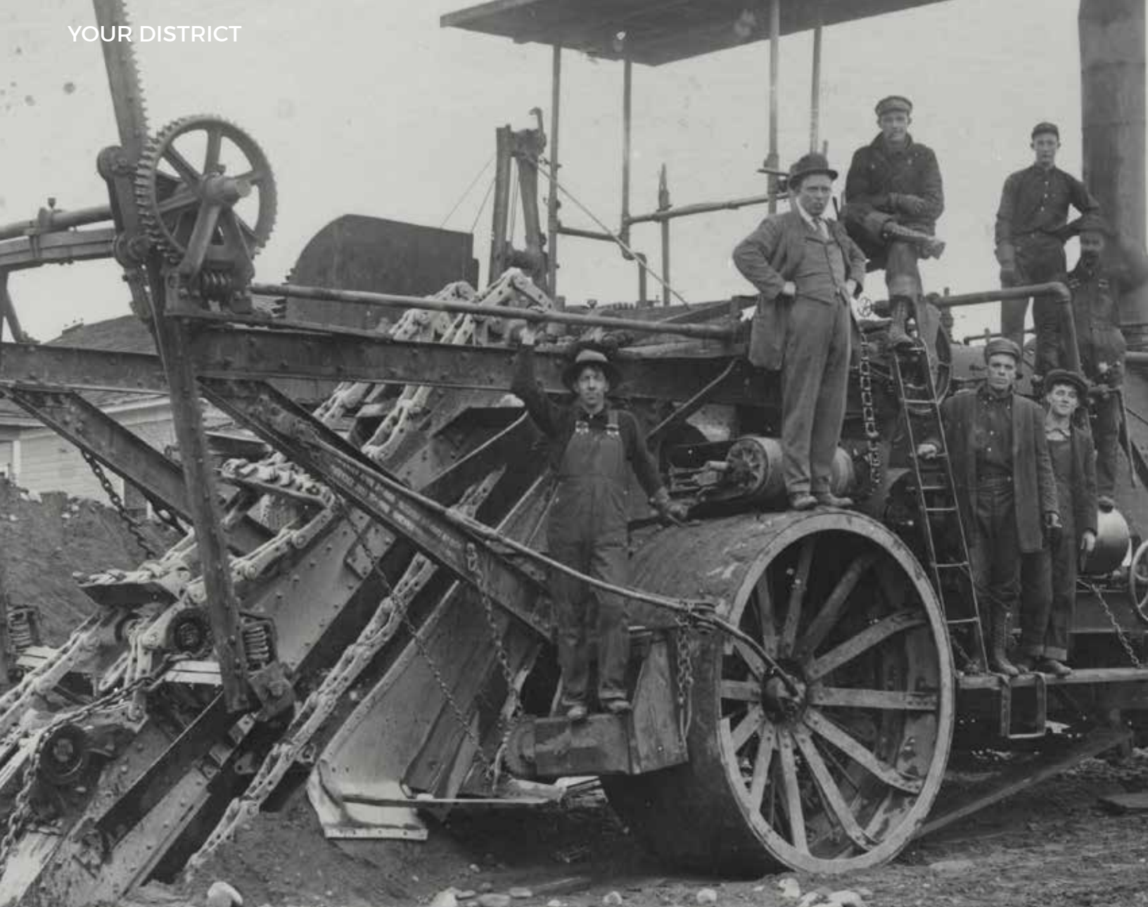
ABOVE: Date unknown. Original caption: Ditch Digger: without this little device, there would have been no Kennewick!