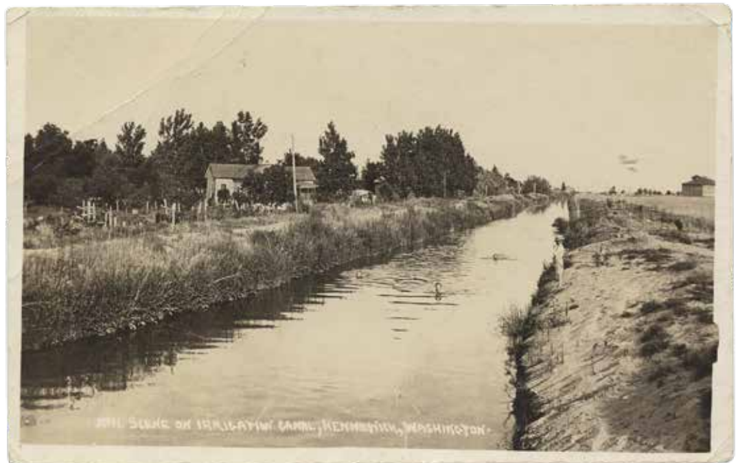
20th SENG OF IRRIGATION CANAL, KENNEWICK, WASHINGTON