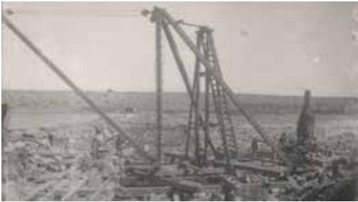
ABOVE: Building dam at head of Kennewick Canal (Horn Rapids Dam) in September 1908.

The deed of transfer from the Northwestern Irrigation Company to the Northern Pacific Irrigation Company was completed.