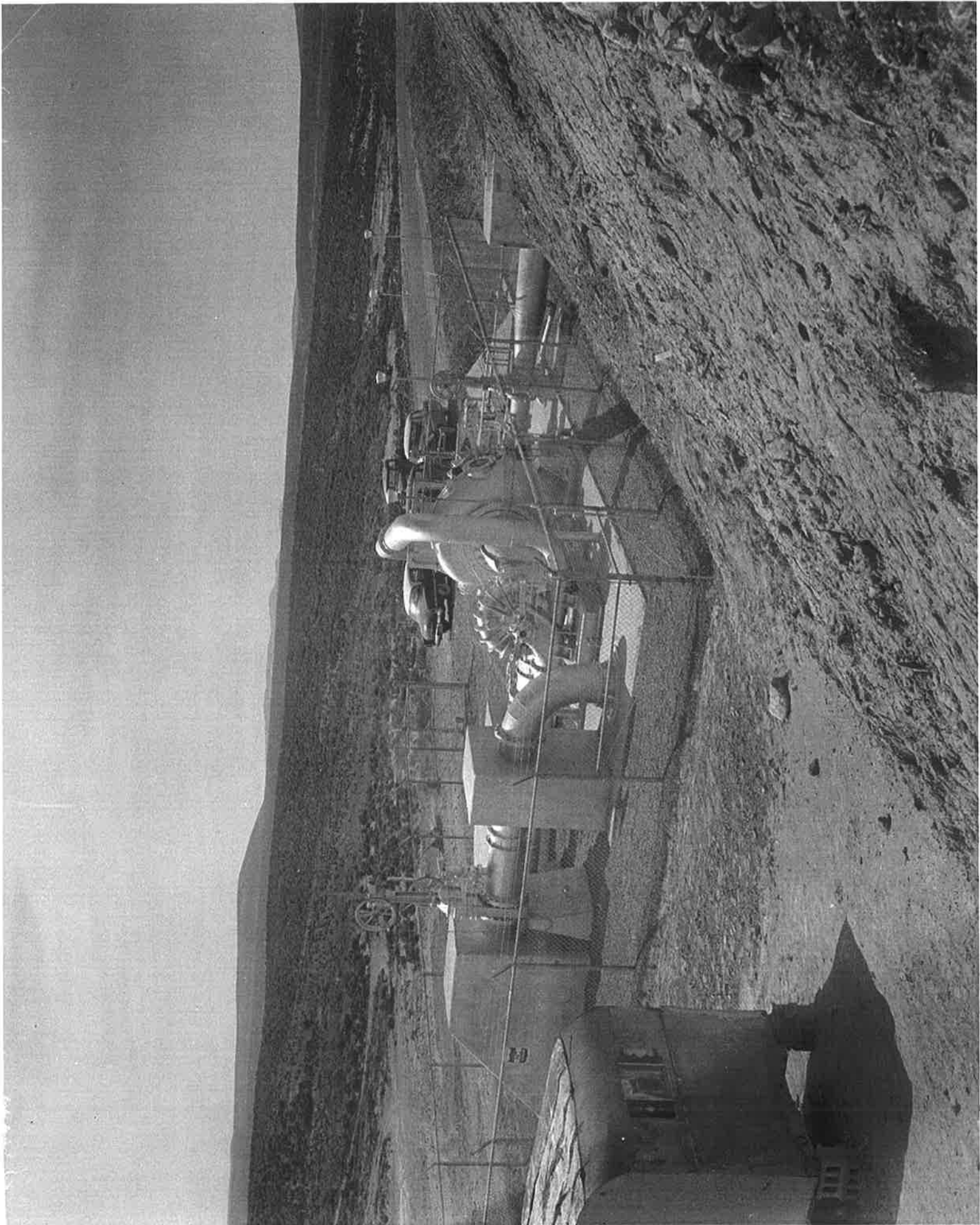
P566-121-1422 Kennewick Division Pumping plant completed by Cherf Bros. Inc.-Sandkay Contractors, Inc. (DC-4323). Photographer unknown. May 14, 1956.