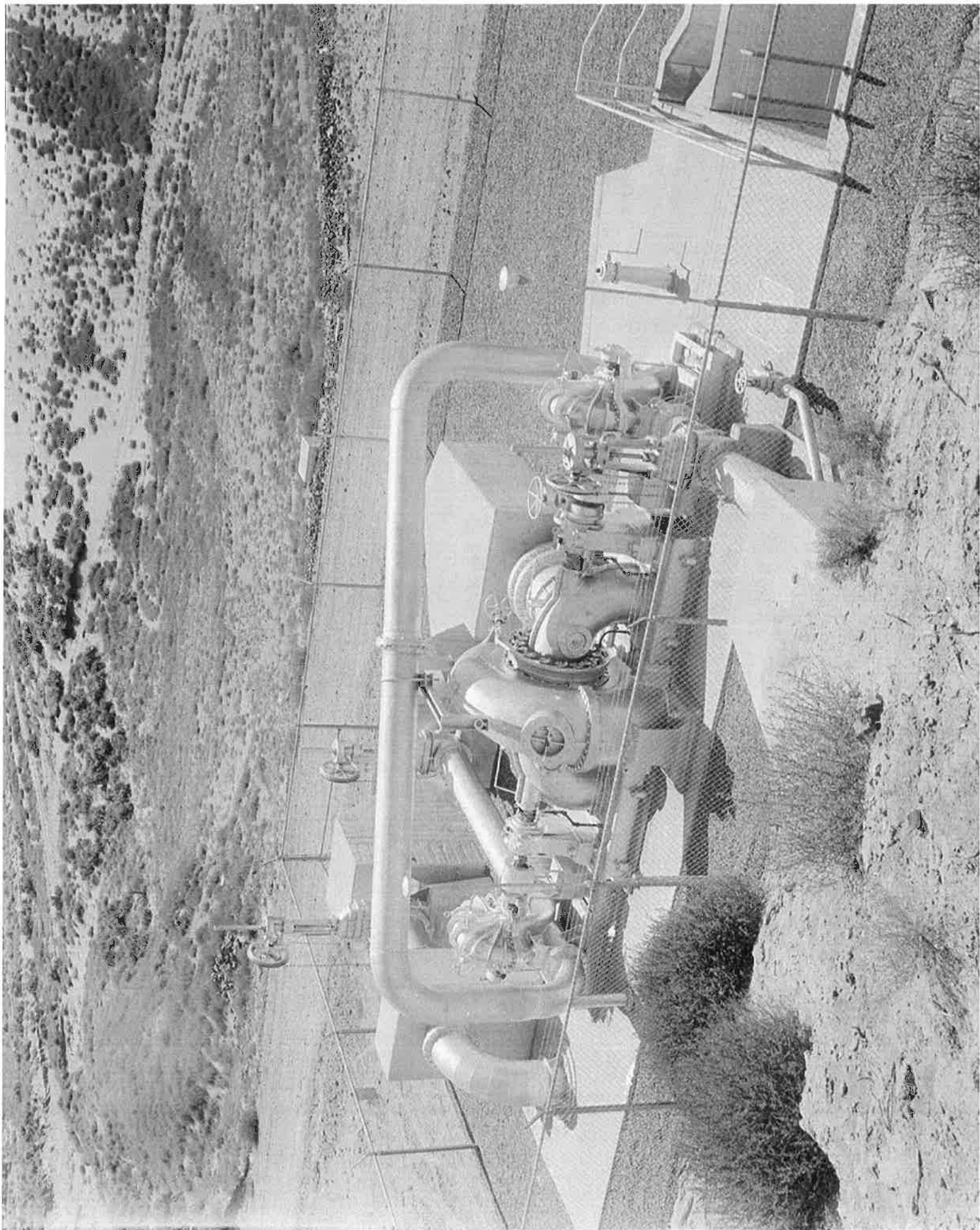
P566-121-1493 Kennewick Division View looking down on Amon Pumping Plant from siphon service road (Specifications DC-4323). Yakima Project, Washington. 7/18/1956.